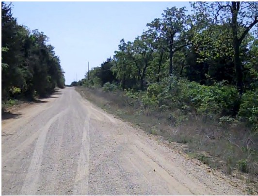
Road frontage view