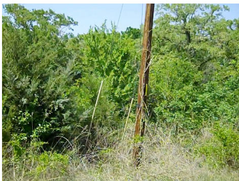
Electric at the Road